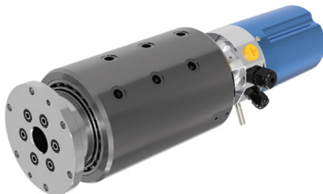
Figure 2: Slip ring solutions can vary vastly in terms of their size and application, depending on the desired specifications. Here is an example of a combo solution with an SRD slip ring and a multi-pass soft seal (MPSS).