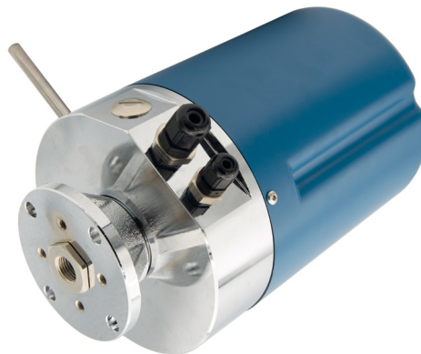
Figure 1: Slip ring solutions can vary vastly in terms of their size and application, depending on the desired specifications. Here is an example of an SRD-30 slip ring.

Machines operated in the robotics, plastics and automation fields, among others, will no doubt benefit from the reliability and quality of products that Deublin always delivers.