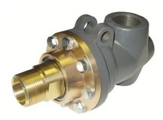
Figure 1: Rotating union for steam and hot oil. Rotary unions are constructed with internal fluid passageways and are offered in various configurations. Monoflow rotary unions have one passage and only allow flow in one direction. Duoflow rotary unions contain two passages that permit fluid to flow in and out of the union. Duoflow rotary unions are typically used for heating or cooling applications.

Rotating unions (also referred to as rotary unions, rotary joints, rotary swivels and rotary couplings) transfer fluids from a stationary source to rotating equipment. In theory, rotating unions are simple mechanical devices. They are comprised of two main components: a stationary member that is connected to inlet pipes or hoses and a rotating component that connects to rotating machines or devices. Bearings facilitate smooth rotary motion while seals keep the fluid media in and contaminants out.